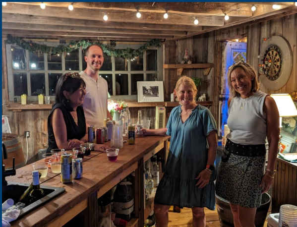
Volunteers tending bar at Band in the Barn.