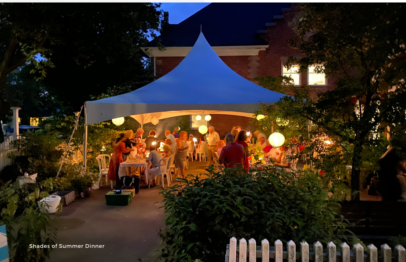
Shades of Summer Dinner