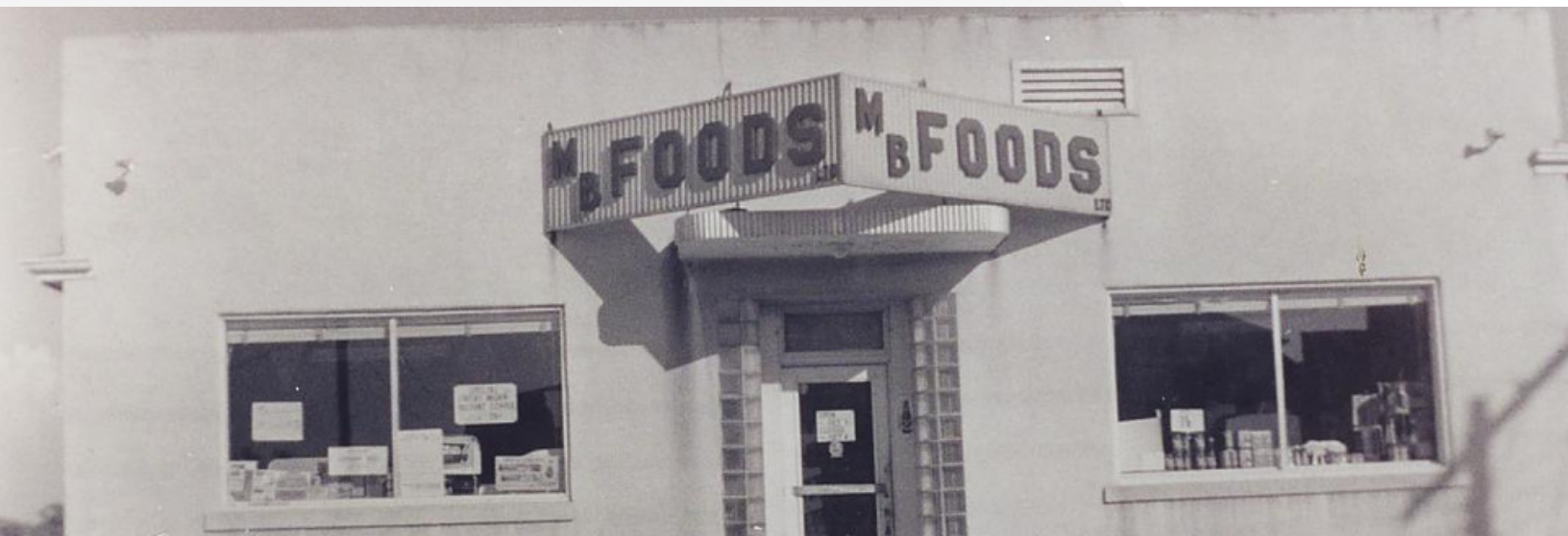
Photo of the original MB Foods in Virgil, c.1957.

We added new research to one of our online exhibitions, Niagara-on-the-Lake's Black History, originally created in 2018. For those unfamiliar with our participation in this platform, it allows us to feature our collection and create online exhibitions. We have over 20 digital exhibitions for you to check out. See them here: https://artsandculture.google.com/partner/niagara-historical-society-museum .