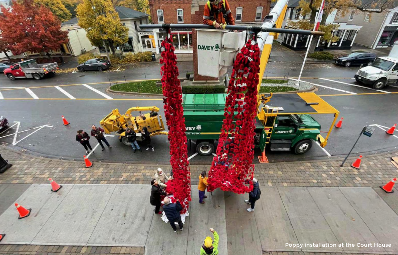
Poppy installation at the Court House.