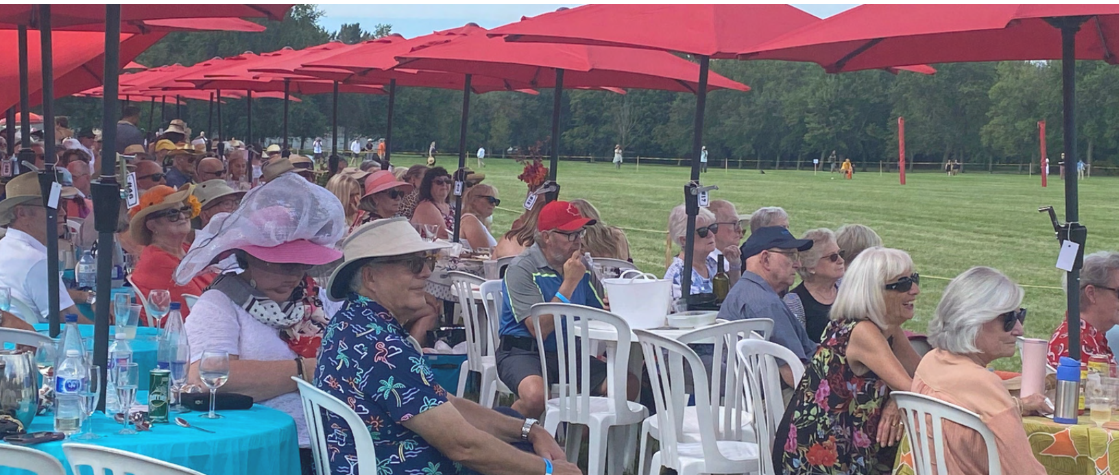
Guests in the Rotary Lounge at Niagara Polo.

2022 Advance Reader's Choice Awards: 3 Diamond Awards for Museums, Kids Camp & Summer Camp