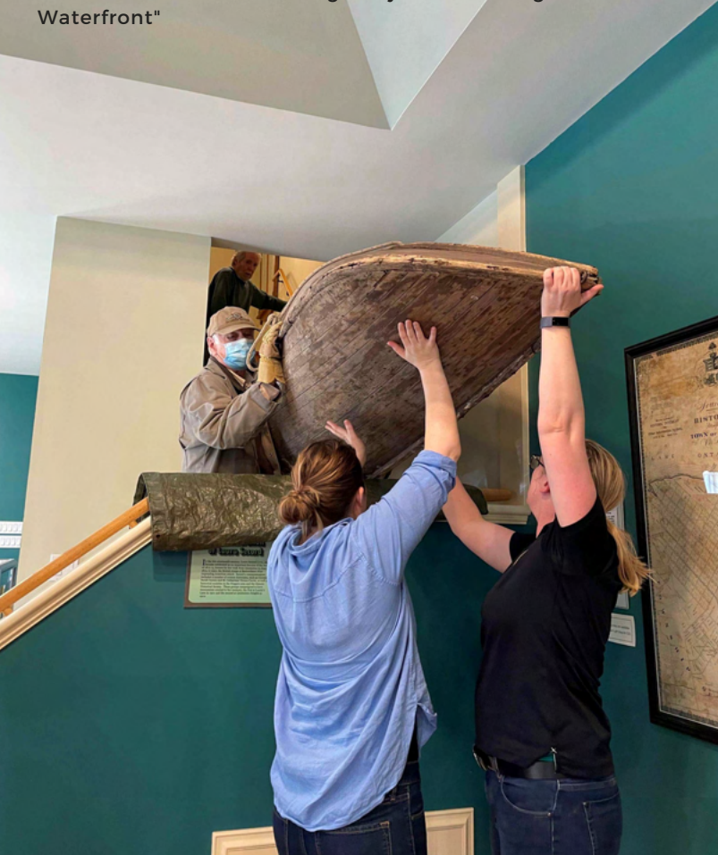
Staff and volunteers moving a row boat from upper Memorial Hall to the lower gallery for "All Along the Waterfront"